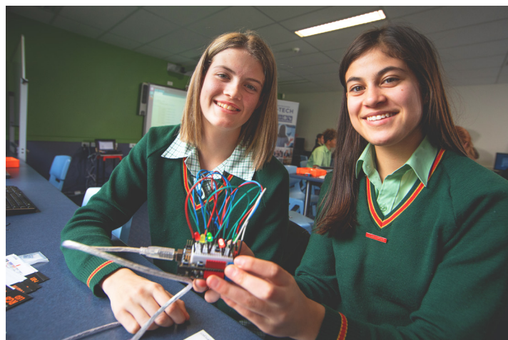
Greater Burnie P-TECH Partnership - Burnie High School