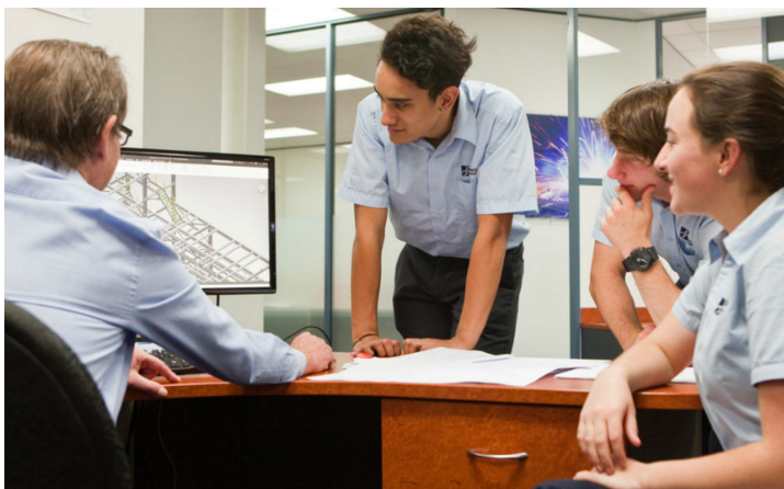
Northern Adelaide P-TECH Partnership - St Patrick's Technical College