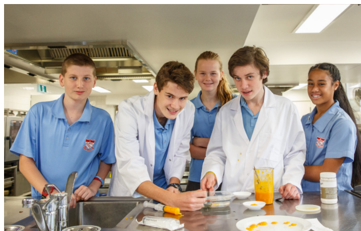
Central Coast P-TECH Partnership - Wyong High School

Collaboration between the education and industry sectors strengthens the connection between student learning and the skills that employers need. In addition, the relationships students develop with their mentors and the school's industry partners improve their prospects when employment opportunities are available with a partner organisation, or within the partners' broader business networks.