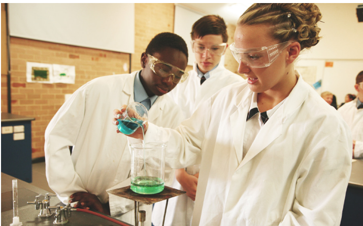
Western Sydney P-TECH Partnership - McCarthy Catholic College