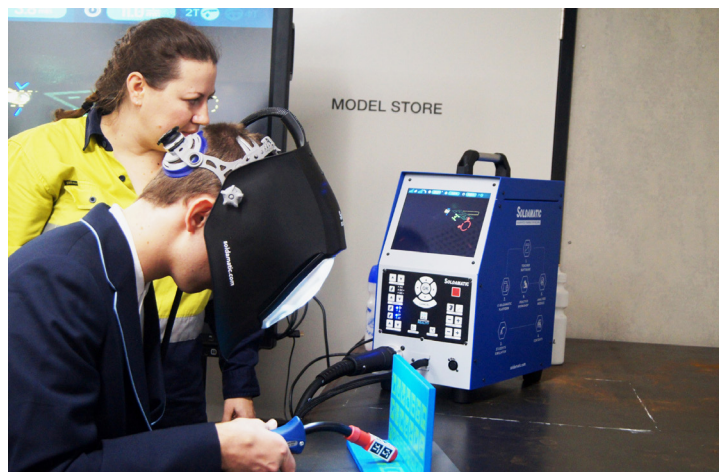
Southern Perth P-TECH Partnership - Cecil Andrews College

The P-TECH model enlists the support and expertise of industry to help prepare students for the world beyond school at a time in their lives when they are making decisions that will influence their career path.