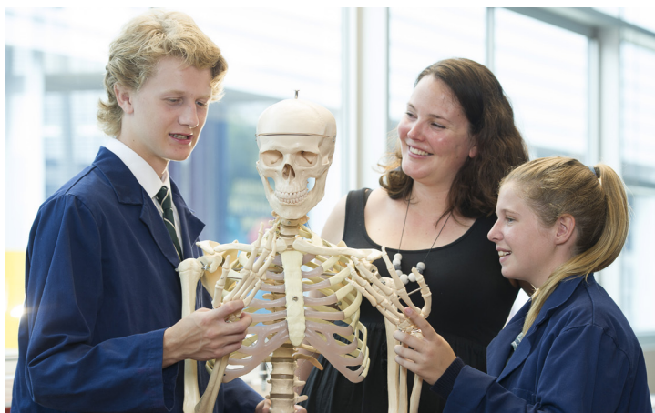
Geelong P-TECH Partnership - Newcomb Secondary College

Deakin University James Cook University NSW TAFE Western Sydney Institute South Metropolitan TAFE TAFE SA The Gordon TAFE University of Newcastle University of Tasmania Western Sydney University