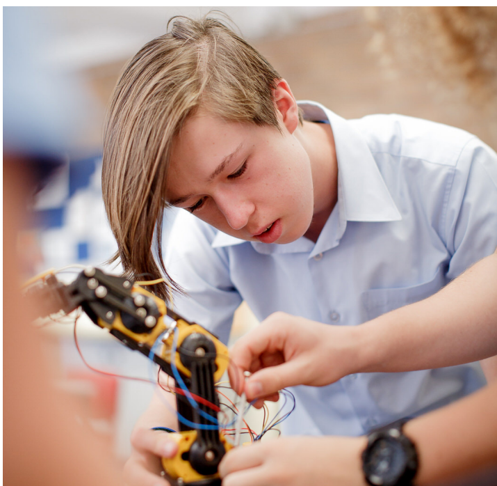
Port Stephens P-TECH Partnership - Hunter River High School